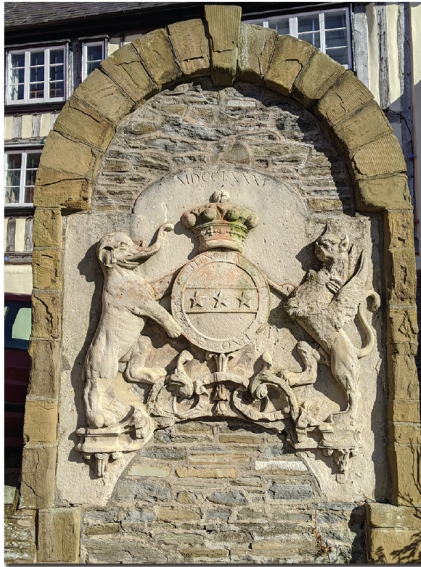
The Clive family crest dating from 1781 in the Old Square marks the start of the Trail

The elephant is rooted in the history of Bishop's Castle dating back to the days of Clive of India and his emblem, the Indian elephant