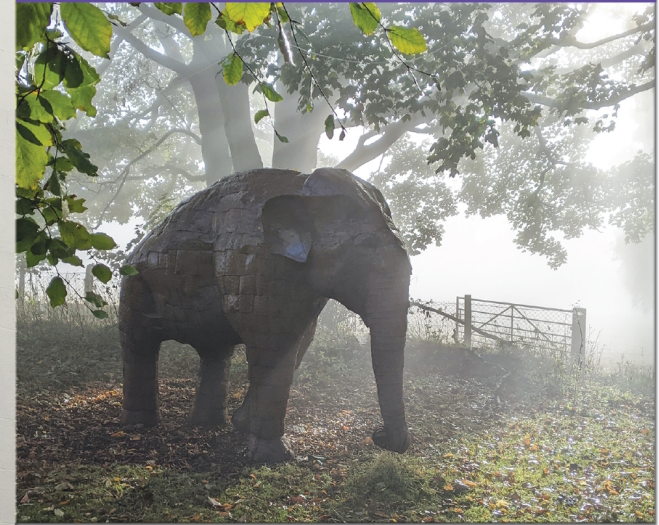
The Metal Elephant at Foxholes Campsite - by Ben Ashton

The 'March of the Elephants' is an elephant-inspired walking trail of varied artworks carefully placed around Bishop's Castle