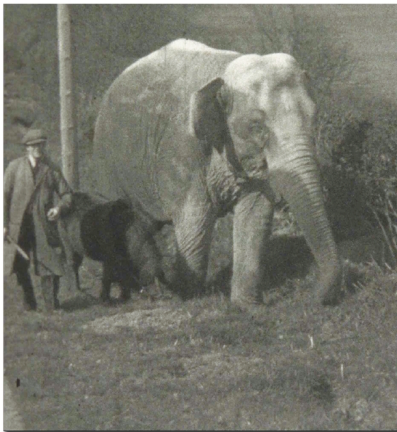
Lizzie the circus elephant being taken for a walk in Bishop's Castle during World War 2

During the Second World War several circuses moved their animals here to avoid air raids. Elephants were housed in stables that stretched across the back of The Castle Hotel car park. At the end of the war one remained unclaimed and continued to live in the Hotel Gatehouse